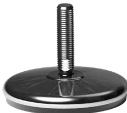
Spindle measures in mm / Misure stelo in mm