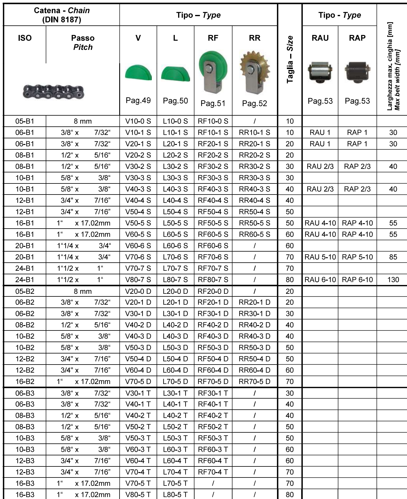
Tabella di scelta KIT / KIT selection table