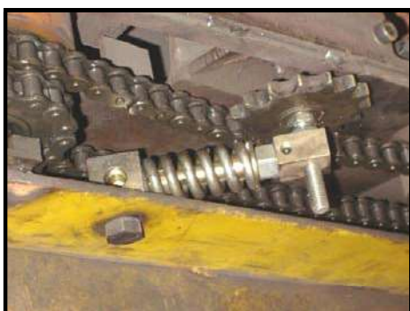
应用图片 / Application photo